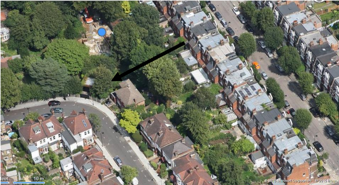
Image 1: Aerial photograph showing the rear of 55 Whitehall Park which fronts onto Fitzwarren Gardens.